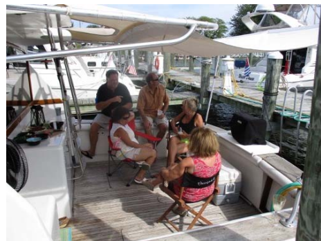
Relaxing on Rhapsody