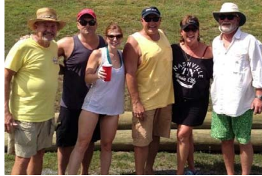
The Winning WYA Teams