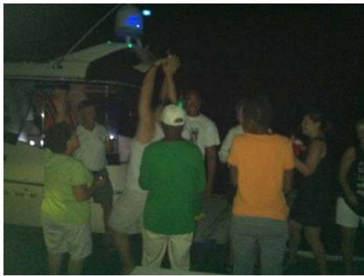
Group dancing Friday night on the dock and